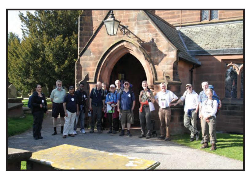
St Chad's Way

Two Saints Way. Introducing the Project. www.twosaintsway.org.uk