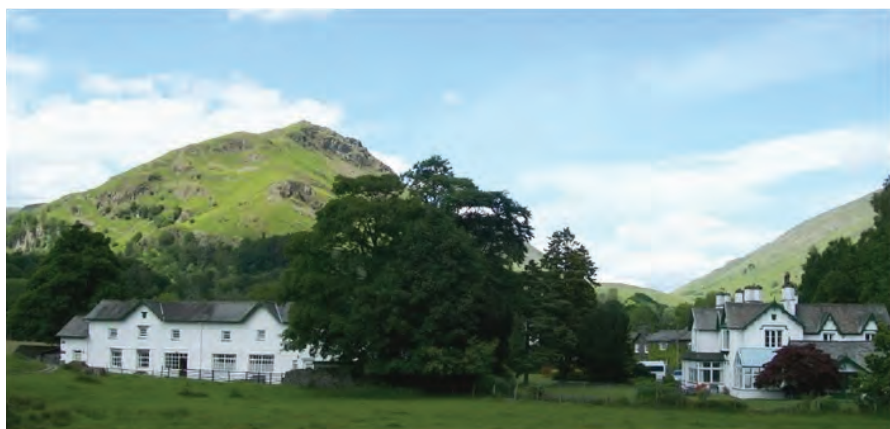
GLENTHORNE ~ Quaker Centre and Guest House