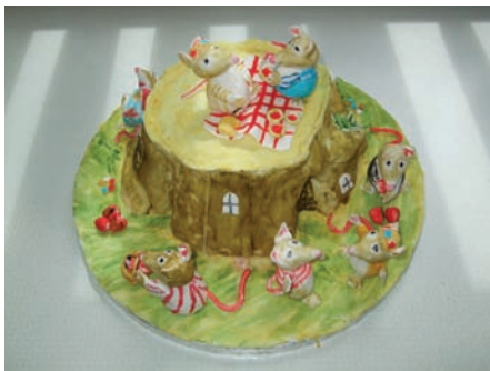
The Rector's cake.