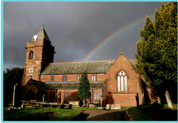
St James' Church at 12 noon on Christmas morning 2014