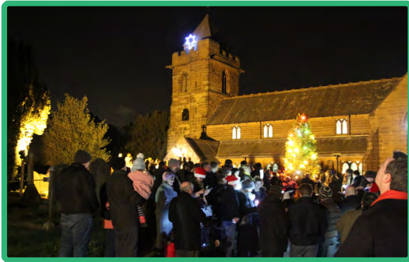
Christmas Eve 2014 Carols around the Tree on Christmas Eve

Heb 13:17 “Obey them that have the rule over you, and submit yourselves: for they watch for your souls, as they that must give account, that they may do it with joy, and not with grief: for that is unprofitable for you”.