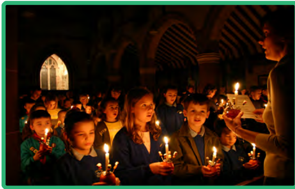
Christleton Primary School Choir in Christingle service in 2005.