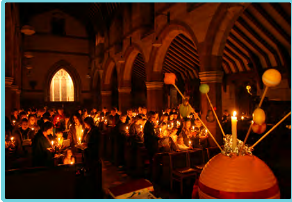
Cross section of attendees at St. James Christingle service 2008