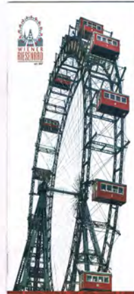
Be carried away by tradition. Riding the wheel of time.