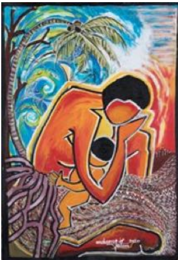
The small Pacific Ocean nation of Vanuatu

Heard at one of our online services a few weeks ago about liturgy and what is right or wrong: "The Lord doesn't care a Kipper!"