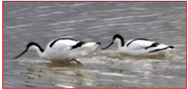
Avocets on the Dee

week we were delighted to see an estimated 30+ pair of Avocets. These amazing black and white waders with their distinctive upward curved bill are now common on that reserve.