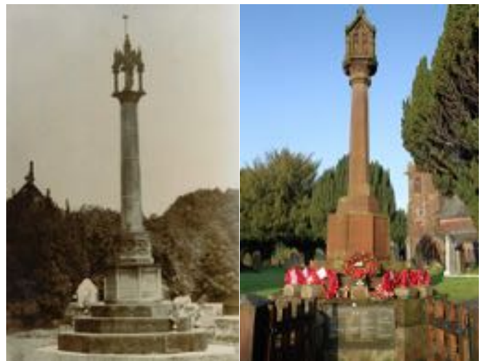
Original and now.

Drama was to unfold in 1928, when strong winds in a great storm, blew down the original sandstone memorial, and it wasn't until a year later with yet more financial support from villagers, that the memorial was repaired. It looks from photographic evidence that the base we see today is the original one, and that it was the sandstone column and crown that were badly damaged, and replaced. This is the memorial we see today, which has the addition of a plaque to commemorate the men who fell in WWII 1939-1945. Inevitably fewer names are on this plaque, just nineteen in fact, but a recent search of the churchyard has found another young man from Great Boughton, who died in 1944, who should now be included on this list.